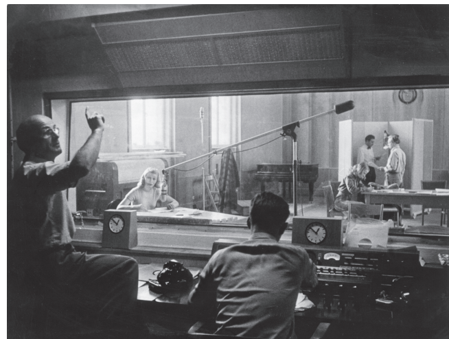
First RFE Studio

Generalkonsulat der Republik Ungarn München