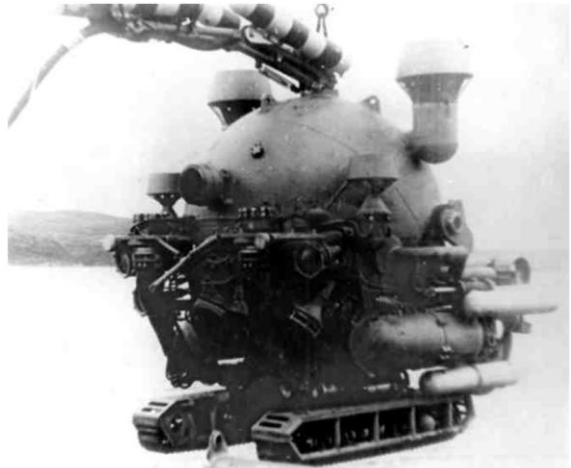
Fig. 3. An older Russian-designed underwater machine.

One disadvantage with underwater craft equipped with caterpillar treads is the energy required for crawling on the seabed. There is, however, an example from the US that demonstrates that it is entirely possible to construct a self-sufficient version of such a machine. In the 1940s, the inventor Halley Hamlin designed a submarine that could travel a distance of 35 km at a speed of 4.5 knots and that was able to run for 32 hours on its batteries with a two-man crew. At both Mälsten and Kappelshamnsviken, there were other indications that a mother submarine may have been involved and even been responsible for the power supply. The second photograph shows an older, well-used Soviet underwater machine, with something that looks like two adjustable engines so that it is able to lift itself up and float, for example up on a mother submarine (Fig. 3).