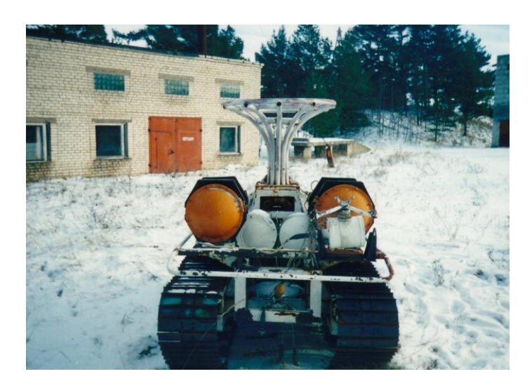
Fig. 2. The former GRU colonel V. A. Plavins, who visited me in February 2007, was accompanied by a

In the Soviet Northern Fleet, there was an India-class submarine (NATO designation) with two smaller so-called rescue submarines in holes in the stern. These were, no doubt, also rescue submarines and, unlike the Argus, were deep draught; but at least one of the types was seemingly designed to be equipped with a caterpillar tread. A midget submarine with a caterpillar tread may be particularly useful when it comes to laying, maintaining, or picking up magnetic or hydrophone cables, an activity that was of relevance for their own harbor defenses, but also for investigating and destroying, prior to war, the SOSUS (sound surveillance system) lines that NATO had laid during the Cold War to keep tabs on Soviet nuclear submarines. The Soviet Union developed midget submarines with caterpillar treads for both civilian and military purposes. This is evident in two Russian books on marine research. The earlier book contains a picture of a mother submarine with two machines with caterpillar treads connected; it is not evident from the picture whether this is for the power supply or steering, or perhaps both. In the photograph, a Russian-designed underwater machine, equipped with a caterpillar tread and a funnel to protect the cable attachment from the mother submarine or some other support vessel, is shown (Fig. 2).