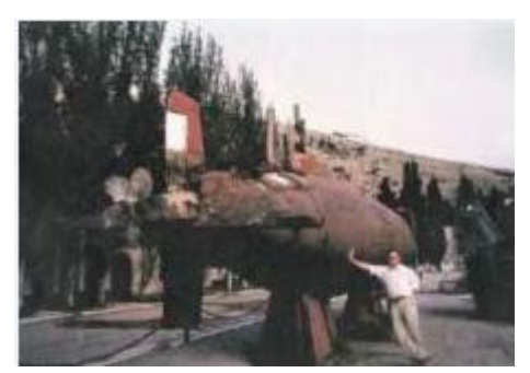
Fig. 4. A Soviet midget submarine.

The description corresponds well with a phenomenon I have encountered many times at presentations on the submarine issue during my tenure as supreme commander. This phenomenon, the so-called 'Whaleback' effect, would cause a wash near the surface and often attract the attention of holidaymakers, but also more professional reconnaissance units. There was even a Politburo decision to send the Delfin unit to Swedish waters in peacetime. This information is available in a book written by the UN Under-Secretary General for Disarmament Issues Arkady N. Shevchenko, who defected from the Soviet Union.